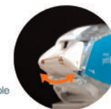
Mini Roller & Flexible head