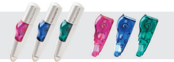
WH-614 WH-615 WH-616 WH-614R WH-615R WH-616R