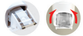
Mini roller head Flexible head function