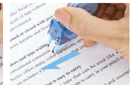
Push for one letter